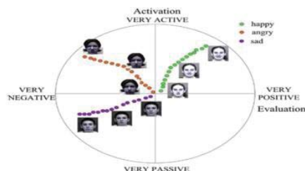
Figure 1. Emotion space spanned by Valence-Activation space [2].

A speech-to-speech translation (S2ST) that responds to a speech signal with recognizing and synthesizing speech in different languages is important for human-machine interface.