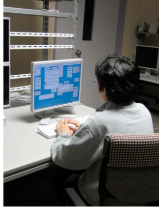
Figure 1. A shot of an experimental setup.